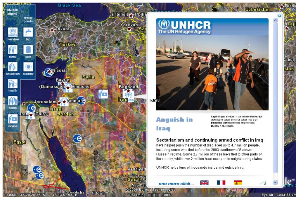
Fig. 2 The UN Refugee Agency – Sectarianism and continuing armed conflict in Iraq